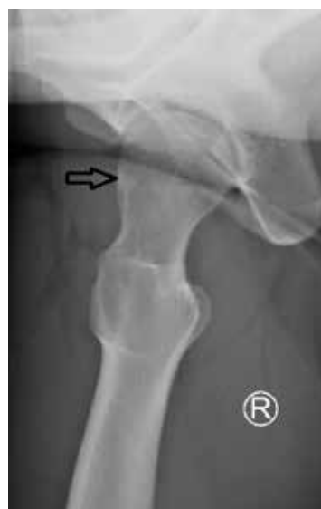
Cam morphology (arrow).

We found an association between a high grade of peri-operative osteochondral damage and conversion to THA. The association was related to both acetabular and femoral osteochondral lesions. Fifteen patients (18%) underwent conversion to THA in the follow-up period. Thirteen of those (87%) were older than 40 years com-