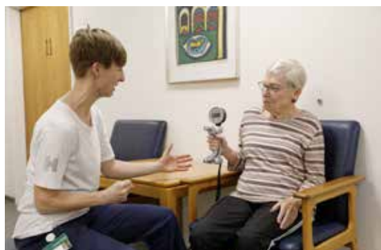
Hand-grip strength testing.