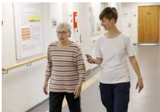
Gait speed testing.

function) [11]. Despite these initiatives and the severe consequences of sarcopenia, a widespread clinical use of the concept is still lacking, and the European algorithm for assessing sarcopenia has not yet been fully implemented in geriatric clinical practice in Denmark.